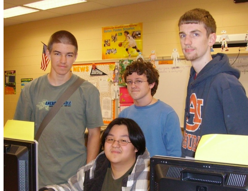
Wildcats succeed at Radford Programming Competitions